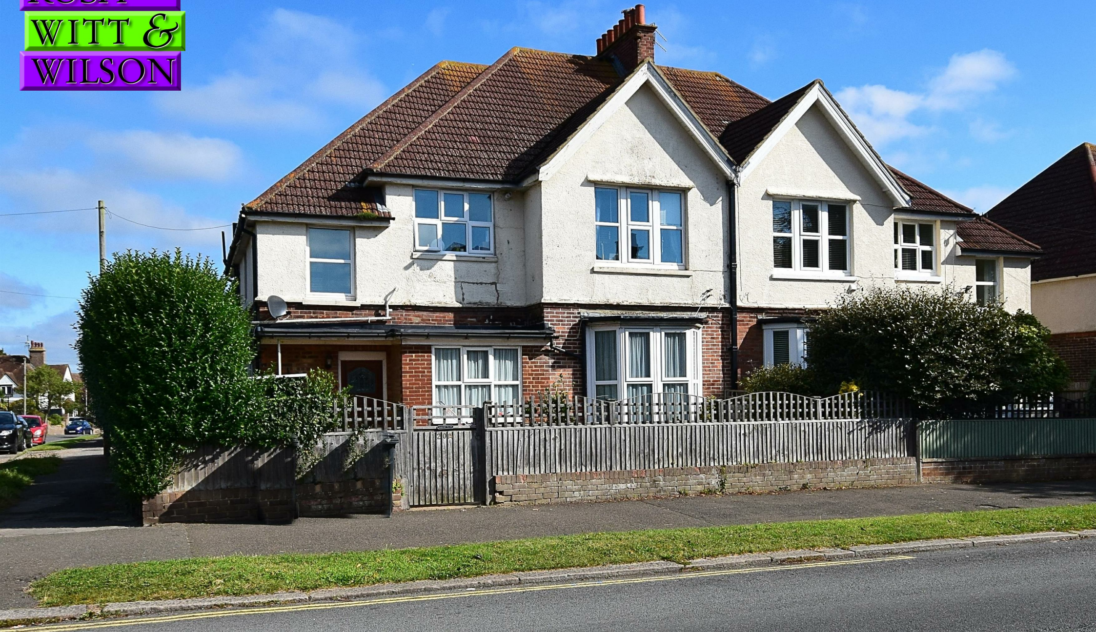
20 Collington Avenue, Bexhill-On-Sea, East Sussex TN39 3QA £265,000